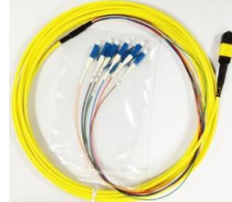
3mm Cable with 12F 0.9mm LC/PC Breakout