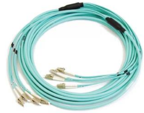
3mm Cable with 2.0mm LC/PC Breakout

PDR MTP/MPO Fanouts are small form factor high-density fiber connector assemblies that breakout into discrete single ferrule connectors. A Fan-Out is used to facilitate the conversion from the ribbon to individual fiber format. Our MTP/MPO Fanouts are suitable for up to 100G applications to connect between equipment or to interconnect modules/panels in a data center. The fanouts also can be used for transitions between high to low bandwidth equipment. The Fanouts are available in Micro cable single and double jacket options and individual connectors are available as simplex/duplex/round duplex cable options. The MTP/MPO and single ferrule connectors are available in Standard and Elite versions to cater customer's power budget requirements the other type fanout patch cord is both end fanout patch cord, it's a low-cost, pre-assembled patch cord that's designed mainly for indoor interconnection between transmission equipment and patch panels or ODFS etc.