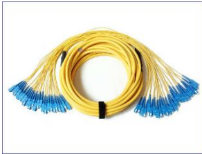
8mm Cable with 24F 2mm SC/PC Breakout